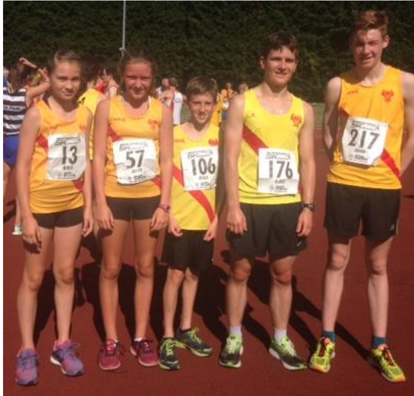
Good to see a squad of HW youngsters testing themselves over 5km on the road