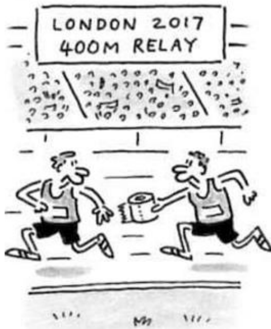
By Matt of the 'Daily Telegraph'